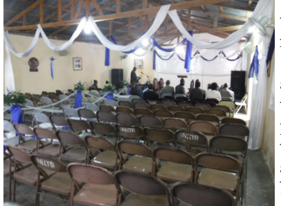
The church with fresh paint and decorated for the wedding!